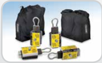
Smart Clamp™ Belt Clamps