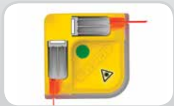
Laser Belt Square