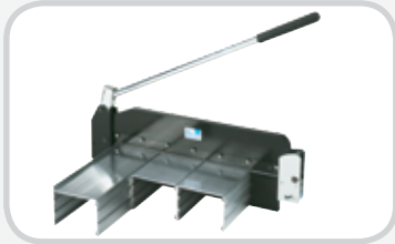
14" Belt Cutter