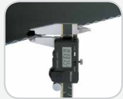
Measure belt thickness.