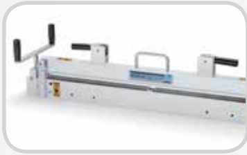
845LD Belt Cutter