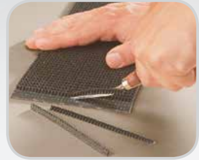
Skive impression cover.

Refer to the material selection chart on page 2 for the metal characteristics which best suit your application. Not all sizes and styles are available in all metals.