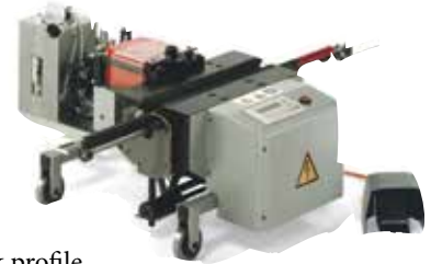
Shown: Pro 6000

Pro Series production lacers feature our patented jaw action – the comb, hooks and belt are simultaneously pulled down as the jaws compress the hooks into the belt, forming an optimal hook profile.