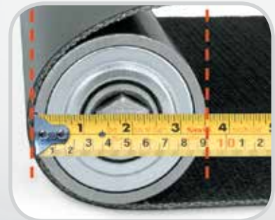
Measure smallest pulley diameter.