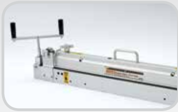
900 Series Belt Cutter

Carbide cuts belt impression cover for quick and clean skiving. Attaches to a 3/8" (10 mm) electric or pneumatic drill (2,500 rpm).