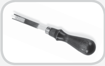
Rough Top Belt Skiver