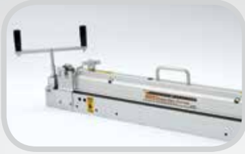
900 Series* Belt Cutter