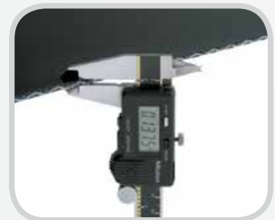
Measure belt thickness.