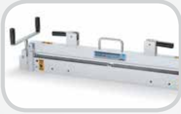
845LD Belt Cutter